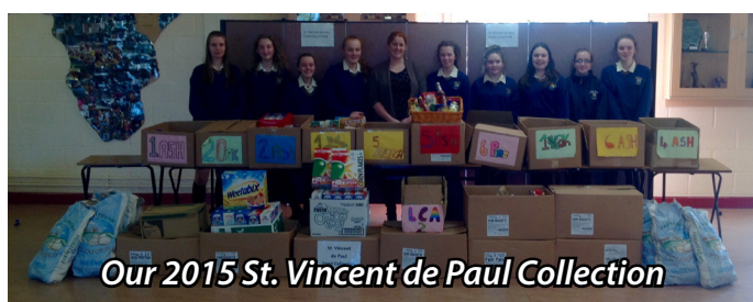
Our 2015 St. Vincent de Paul Collection

This year again we ran a very successful food appeal for our local St. Vincent de Paul Society. On 8th December we presented twenty two full boxes of food and drinks and ten bags of potatoes to St. Vincent de Paul who create food hampers for local families for Christmas. In Coláiste Bhríde we are very proud of our charity work and the generosity of all is greatly appreciated.