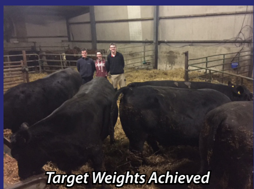
Target Weights Achieved

From 250kilograms to 700kilograms, our famous five Irish Angus Steers saw their end during the early stages of December, 2015 in ABP Waterford . Now the competition is nearly at an end and the overall winners will be announced in March 2016. The Competition is fierce but it's appropriate to mention that we are all winners as it is, especially with each of us taking home a nice amount of profit to spend as we wish!