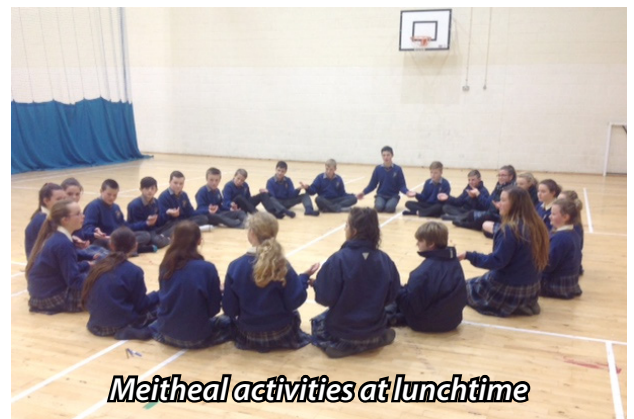
Meitheal activities at lunchtime

Meitheal is a mentoring system between 6th year and 1st year students and it enables senior students to influence the happiness and wellbeing of 1st years. This scheme has been running successfully for a number of years in Coláiste Bhríde and continues to go from strength to strength with the high calibre of senior students we have in the school. It is a credit to their parents that we have such a great community of volunteerism in the school. Volunteering is a great way of connecting with your community, learning new skills and gaining valuable work experience. This year our sixteen Meitheal leaders are continuing this tradition and are making a positive contribution to the progress of the 1st year group. Since the beginning of the year they have been involved in a wide range of activities to help the first years integrate into our school. On behalf of the 1st years I would like to thank our Meitheal leaders for their on-going hard work and commitment.