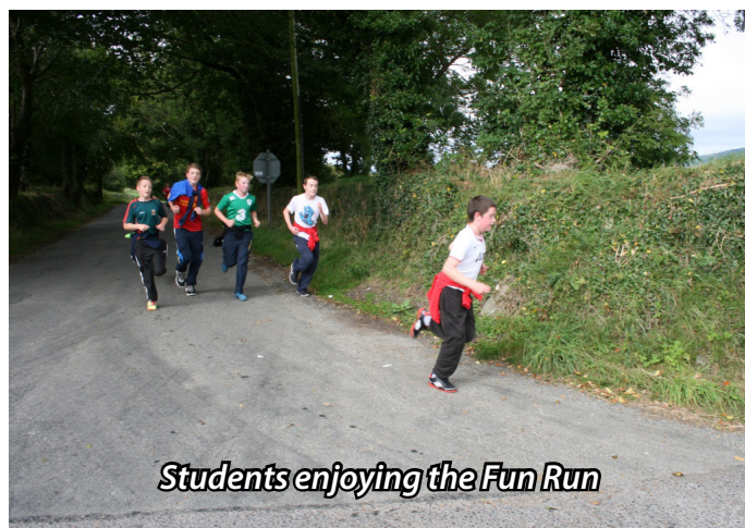
Students enjoying the Fun Run

On Wednesday, 23rd September the P.E. department hosted our annual fun run. Shortly after break time, lead by the energetic P.E. department, the first group of students was warmed up to the sound of pumping tunes and by about 11a.m. the last of the students had set off on the 4 km course around Carnew. A great sense of community was achieved as the students and teachers pounded the road to complete the loop.