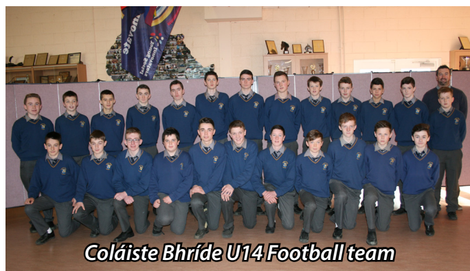
Coláiste Bhríde U14 Football team

As we look forward to Christmas the 1st years await their second match in the Wicklow county championship. They have been training since September and all these training sessions paid off after a win in their first championship match where they played Scoil Clongais, Baltinglass. They won the game on a score line of 5-12 to 3-3 putting in a very strong team performance. The team were due to play the second round on 7th December however weather conditions led to the cancellation of the match. Instead they will play on Monday, 14th December against St Kevin's Dunlavin and it will take place in Carnew GAA pitch.