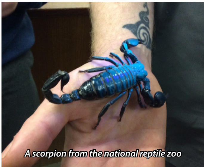
A scorpion from the national reptile zoo