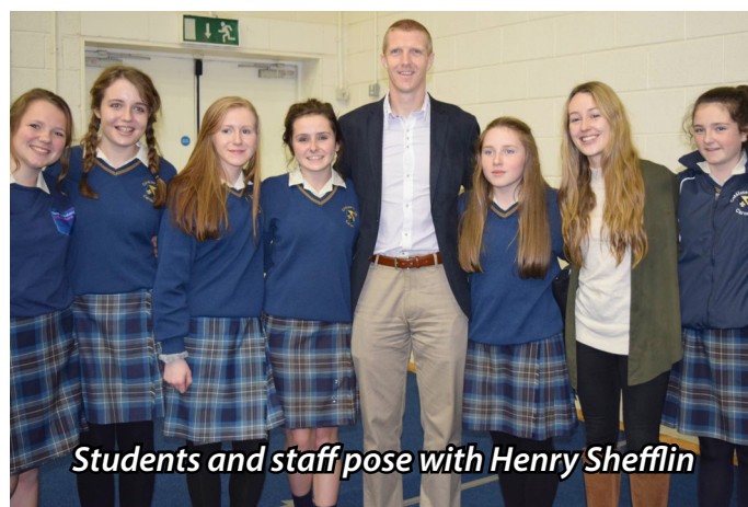
Students and staff pose with Henry Shefflin