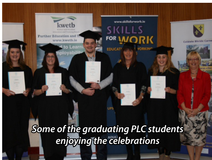
Some of the graduating PLC students enjoying the celebrations