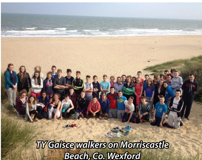
TY Gaisce walkers on Morriscastle Beach, Co. Wexford

At the beginning of their Transition Year Programme all students engaged in an in-house induction session. During this day, students made choices from a myriad of modules and long courses. Academic choices were explained and carefully selected. For these academic choices, students benefit greatly from having an extra year to work at their core subjects in preparation for their Leaving Certificate examinations.