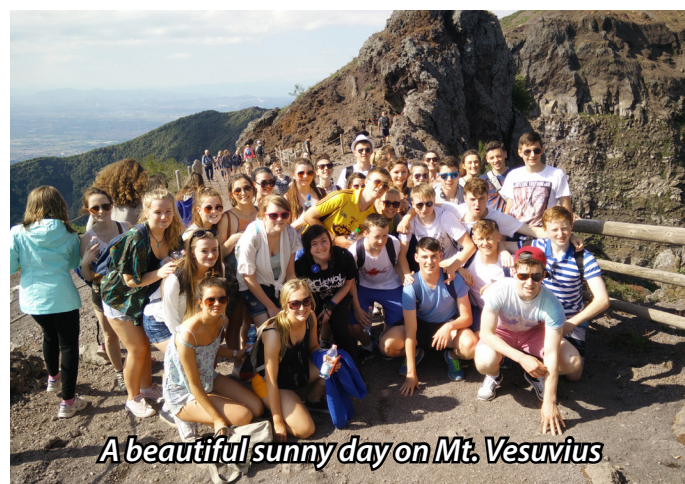
A beautiful sunny day on Mt. Vesuvius