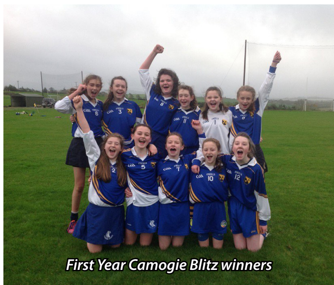
First Year Camogie Blitz winners

experienced Presentation De La Salle College. The future looks bright however as many junior ladies played a vital role during the season.