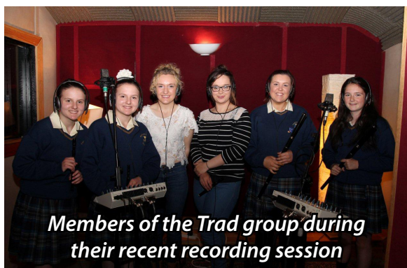
Members of the Trad group during their recent recording session