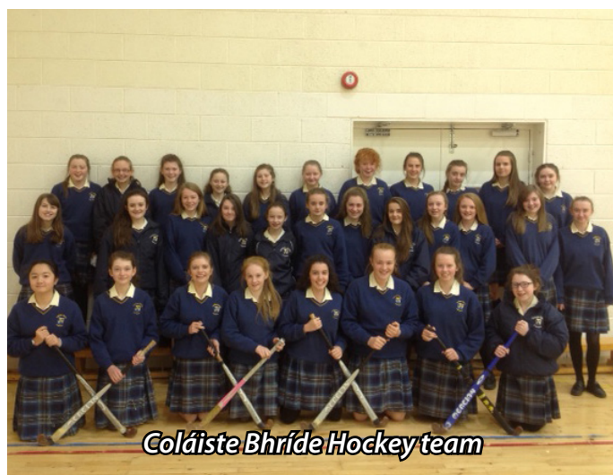
Coláiste Bhríde Hockey team