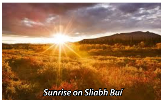
Sunrise on Sliabh Buí