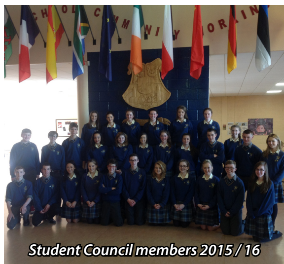
Student Council members 2015/16

Other projects the council is currently working on: