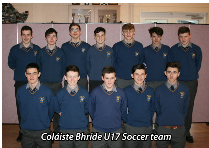
Coláiste Bhríde U17 Soccer team

We would like to thank the various clubs and people who support the development of soccer in our school and have done for the past number of years. The use of Coolafancy Community field and Shillelagh United have been enormous benefit to us not to mention the facilities at Carnew Celtic without which we could not run Coláiste Bhríde soccer.