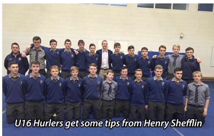
U16 Hurlers get some tips from Henry Shefflin

The under 16 hurling team reached the South Leinster final where they lost out to PDLS Bagenalstown, after extra time. The team did extremely well to get to the final, having beaten Grennan College, Thomastown and Wexford CBS en route. The team had led in the final until the last minute of normal time, when Bagenalstown levelled the game with a free. The team eventually lost out on a scoreline of 2-13 to 1-12. This group of players trained very hard and with over thirty panel members, hurling is definitely going in the right direction in the school.