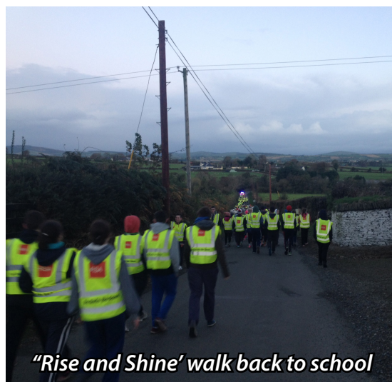
"Rise and Shine" walk back to school

At a chosen spot on Sliabh Buí, we had a brief gratitude ceremony where a number of students read some poems and short stories focusing on the good in our lives. It was a truly breathtaking experience. There was a lovely atmosphere on the morning and the weather conditions were ideal. As part of the morning, breakfast was provided on arrival back at school for all who walked. Many local companies were extremely generous in donating items for the breakfast and it was a lovely way to end the morning.