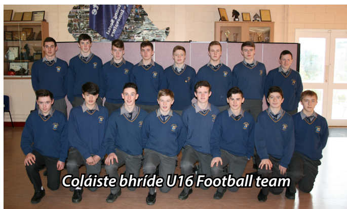
Coláiste bhríde U16 Football team

With two wins from two for Coláiste Bhríde, the possibility of getting out of the group stage remains a very achievable goal at this stage. After battling back with four goals to turn around a three point deficit at half time in the first game, both desire and footballing quality was clearly evident throughout the team. A final group game against Árdcoil na Tríonoide, Athy will decide our fate. Although travelling away will prove challenging there's no doubt with the fighting spirit shown to date there is a real chance of upsetting the group favourites. With many players involved eligible for next year the future looks bright. The commitment of the players to both training and matches has been unquestionable throughout.