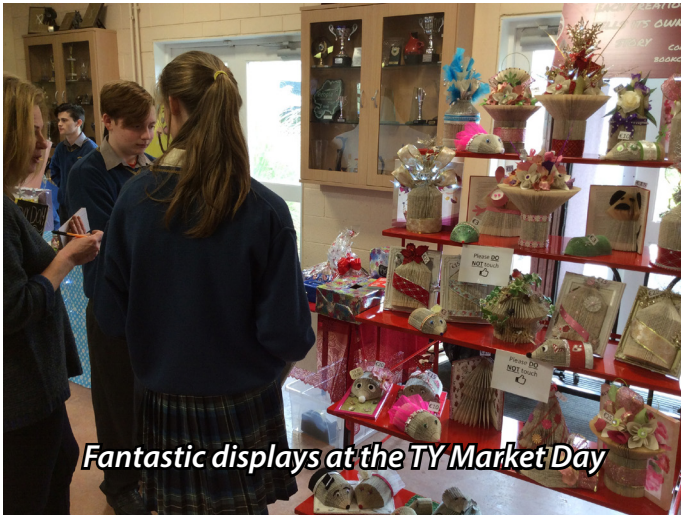
Fantastic displays at the TY Market Day