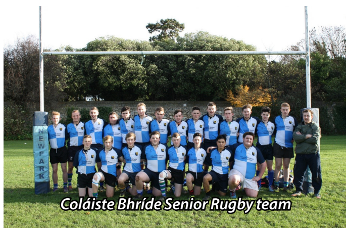
Coláiste Bhríde Senior Rugby team

The Coláiste Bhríde senior rugby team is approaching the Christmas break in anticipation of two Leinster semi-finals and a well-deserved place in the Vinnie Murray Cup. Training and preparations for the season started in early September. These sessions highlighted the strong team spirit, talent and experience amongst the squad which gave a solid platform for the Leinster Development Cup.