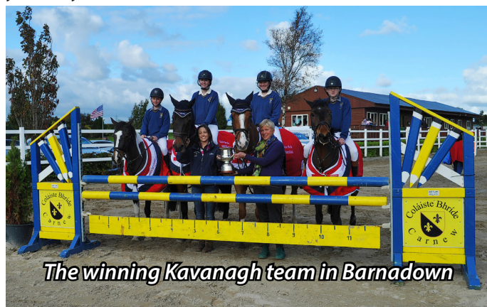
The winning Kavanagh team in Barnadown