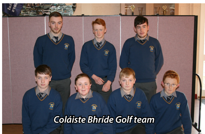
Coláiste Bhríde Golf team

This victory was not only rewarded with a place in the McMullen Cup semi-final against CBS St Mary's Enniscorthy, but also a place in the Vinnie Murray Cup, which is the third time this team has broken new ground this year! This determined squad of players are eagerly looking forward to the next stages of their season. The junior team has also been training and preparing for their Leinster Shield campaign and had a convincing win against St David's, Greystones before Christmas. They are also looking forward to their next match which will be against CBS New Ross in the Leinster Shield.