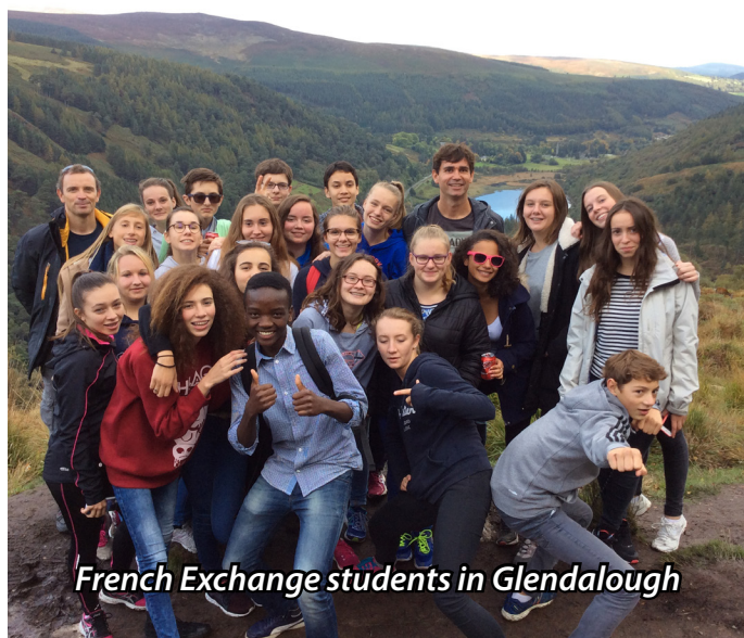
French Exchange students in Glendalough