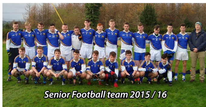
Senior Football team 2015 / 16

The team is currently preparing for the Leinster Championship where they face Portarlington at home on the 15th December. They are an excellent group of players to work with and giving incredible service to Coláiste Bhríde football. This year's defeat was their first in six years.