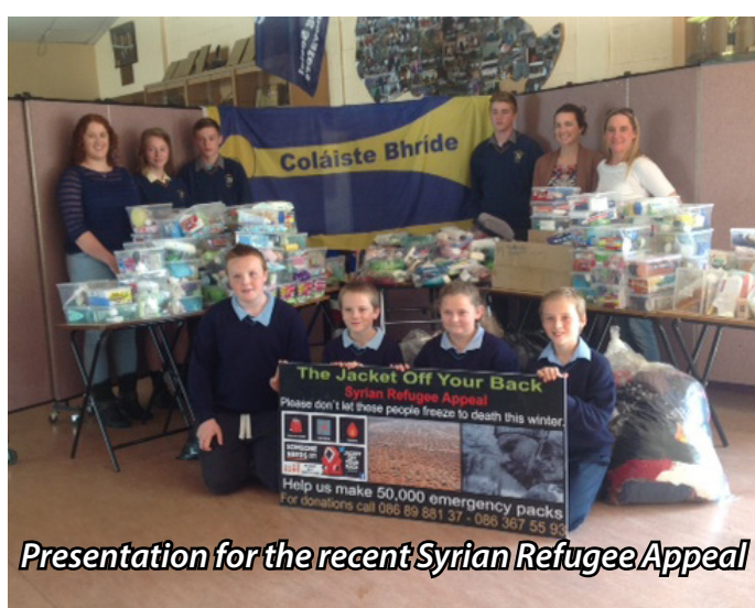
Presentation for the recent Syrian Refugee Appeal

Both pupils and teachers alike showed an overwhelming support for the Syrian refugees. In conjunction with the charity 'The Jacket Off Your Back', they collected much needed toiletries for these men, women and children in need. The toiletries were organised and labelled into personal packs for the refugees and given to a volunteer from the charity. What an innovative and generous, yet simple gift to give the refugees - well done to all!